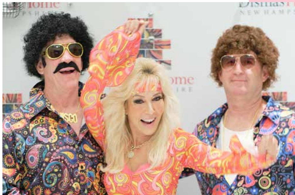
2024 Over the Edge fundraising event (left); 2024 Denim and Diamonds Disco Gala (right).